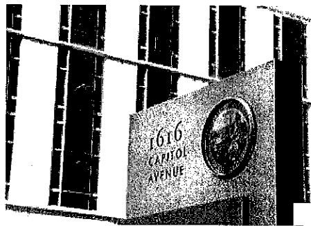
In 2009, California's Department of Public Health quietly ordered its investigators to dismiss nearly 1,000 pending cases of abuse and theft.

No significant regulatory hurdles blocked Diocampo from working with vulnerable patients during the